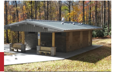
Julian Price Park Campground