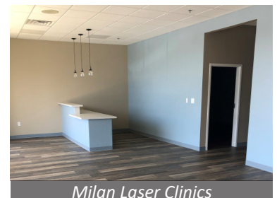
Milan Laser Clinics