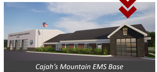
Cajah's Mountain EMS Base