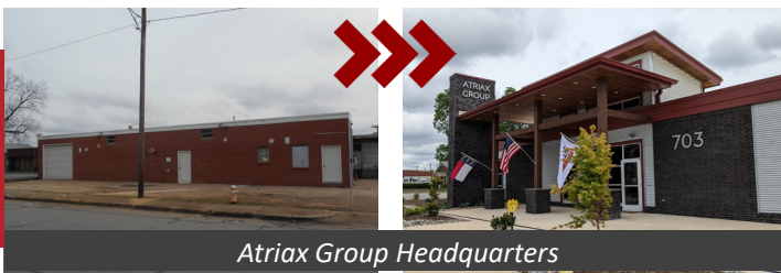
Atriax Group Headquarters