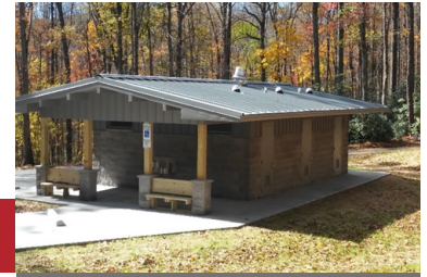
Julian Price Park Campground