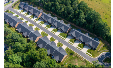
Wye Station Townhomes