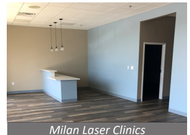
Milan Laser Clinics