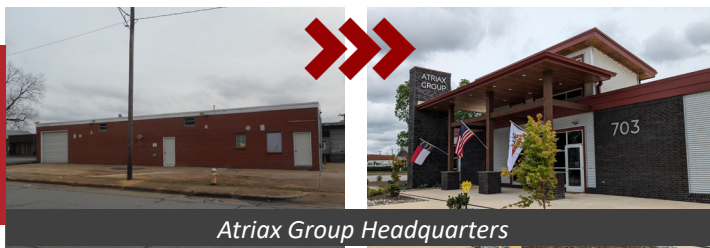
Atriax Group Headquarters

Wye Station Townhomes | 20+ townhome development in Conover, NC